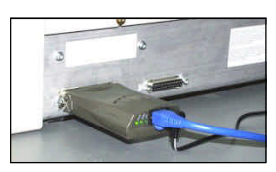
The 8900 Ethernet interface provides a flexible solution for LAN environments.

Printer stand Stand mounted basket Printer mounted basket Acoustic cover Bar code/OCR font Presenter and Prestige Elite font DECLA120 RS-422 RS-423 Current loop MacAdapter