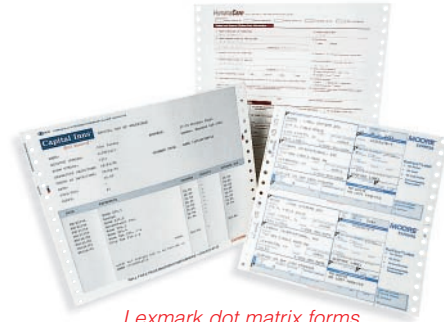
Lexmark dot matrix forms printers let you communicate with clarity and impact.

Low operating costs, reliable printing and improved performance are the foundation of the 2300 plus family. Printer ribbons are interchangeable between wide- and narrow-carriage models and are compatible with previous 2300 printers, so you can save money while managing your supplies inventory more efficiently.