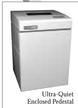
Ultra-Quiet Enclosed Pedestal