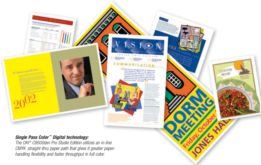
Single Pass Color™ Digital technology: The OKI® C9500dxn Pro Studio Edition utilizes an in-line CMYK straight-thru paper path that gives it greater paper-handling flexibility and faster throughput in full color.