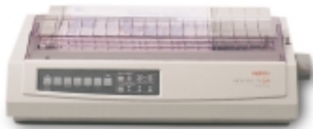
ML391 Turbo wide-carriage printer