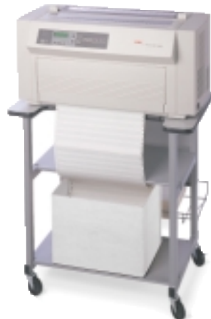
The PACEMARK 4410 (Shown with optional printer stand. For information, call 800-749-2258.)